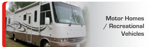
Motor Homes / Recreational Vehicles