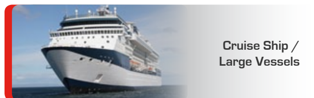
Cruise Ship / Large Vessels