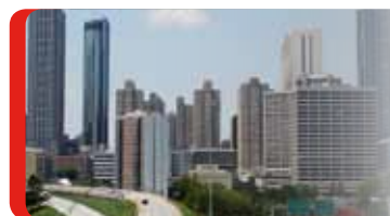
In-building, Fixed Site Applications