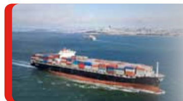
Cargo Vessel / Captain & Crew Calling