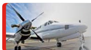
Light Aircraft & Helicopter