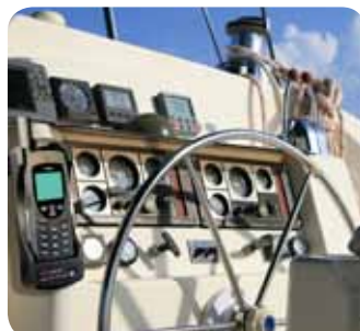
Beam SatDOCK, In-Vessel Application