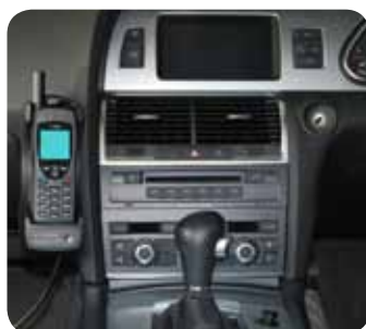
SatDOCK 9555 In-Vehicle Application