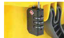
TSA approved padlock