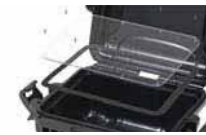
Waterproof panel kit