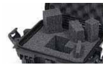
Multilayer cubed foam